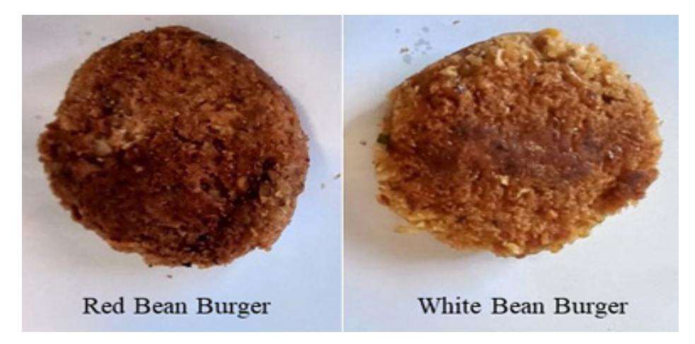
Fig. 3. Burger prepared from white and red kidney bean

t: Student t-test *: Statistically significant at p \le 0.05